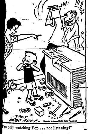
"I'm only watching Pop... not listening!"