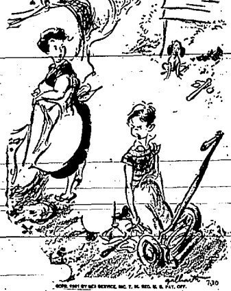
"When I loosed the nuts, it won't cut, and if I tighten 'em, it's too hard to push—wish Dad was motor-minded!"