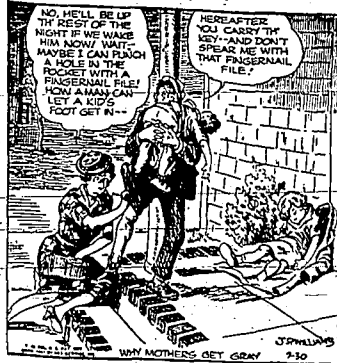
WHY MOTHERS GET GRAY 2-10