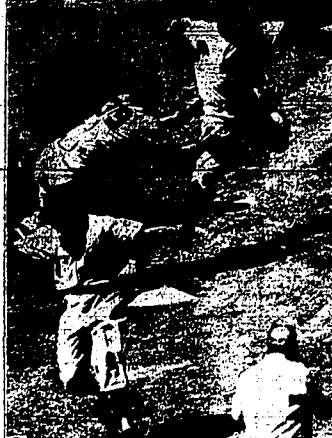
PHOTOGRAPHER GETS A GOOD CLOSE-UP OF WHAT COMES CLOSE TO BEING A TRAFFIC JAM.