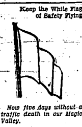
Now five days without a traffic death in our Magic Valley.