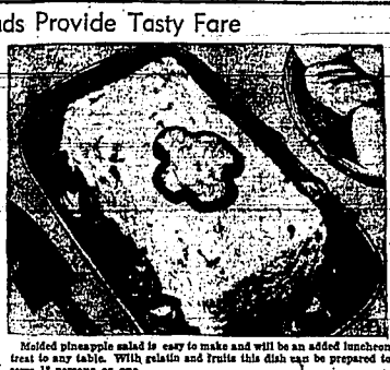
Molded pineapple salad is easy to make and will be an added luncheon treat to any table. With gelatin and fruit this dish can be prepared to serve 12 persons or one.