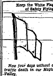
Now four days without a traffic death in our Magic Valley.

Prepared information pamphlets to guide visitors through the hospital are ready for Saturday. The Chamber of Commerce has prepared information pamphlets to guide visitors through the hospital are ready for Saturday. The Chamber of Commerce has prepared information pamphlets to guide visitors through the hospital are ready for Saturday.