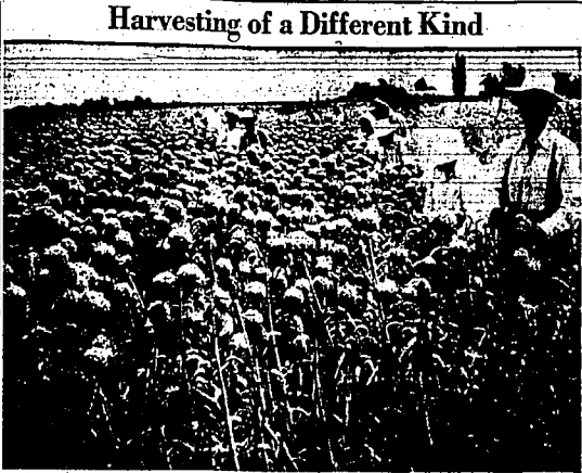
Not all the harvesting in Magic Valley is grain. Here is part of a crew of 25 workers on the Chet Hobson ranch east of Burli who are harvesting Hobson's crop of onion seed. Hobson has also acres of onion seed and the crop has to be harvested at just the proper time. If harvested too soon the seeds will germinate. The seeds are spread on tarpaulins to dry and must be turned every day to prevent germination. After drying the seeds are threshed.