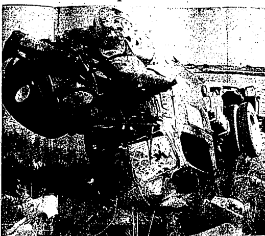
Harold Murphy, Twin Falls, and two Idaho Falls youths escaped death when this two-ton truck driven by Murphy and a 1934 Nash sedan driven by one of the Idaho Falls youths collided Tuesday at the intersection of highways 93 and 30 west of Curry. State police said the sedan ran through the stop sign at the end of Highway 93 at high speed. The three were injured only slightly although both vehicles were demolished.