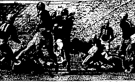
A ballgent embrace from a Santa Clara player came too late to stop the Cassia division of the Minidoka national forest south of Twin Falls Thursday in the largest special hunt so far held in Idaho this fall.