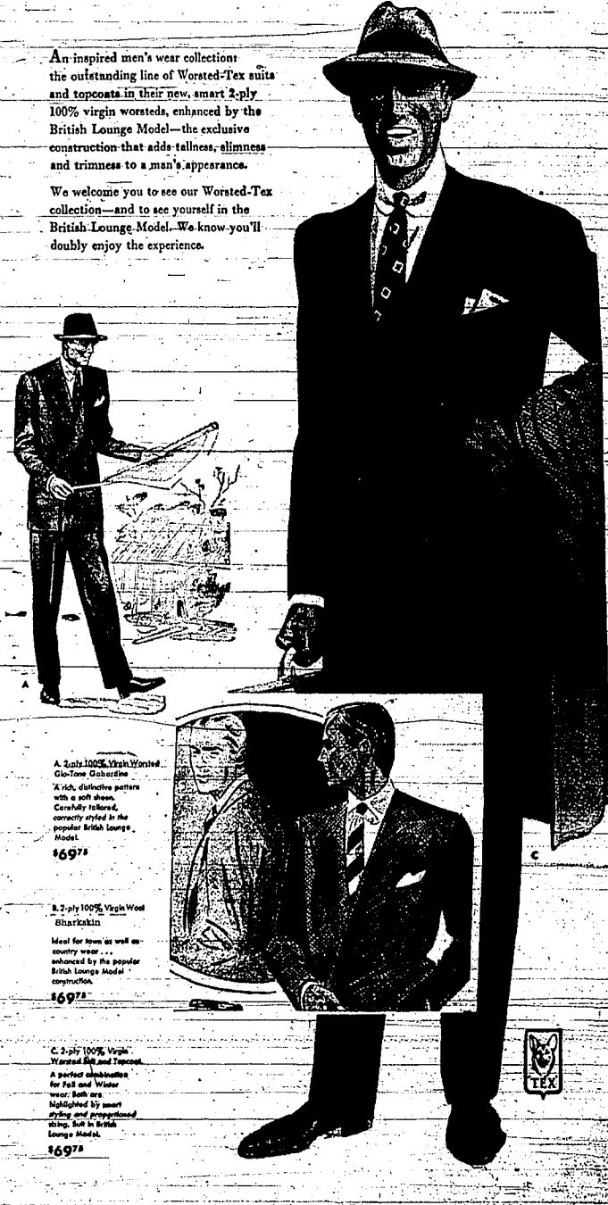
A. 2-ply 100% Virgin Worsted. Glo-Tone Gabardine. A rich, distinctive pattern with a soft sheen. Carefully tailored, correctly styled in the popular British Lounge Model. $69.75

An inspired men's wear collection: the outstanding line of Worsted-Tex suits and topcoats in their new, smart 2-ply 100% virgin worsteds, enhanced by the British Lounge Model—the exclusive construction that adds tallness, slinness and trimness to a man's appearance. We welcome you to see our Worsted-Tex collection—and to see yourself in the British Lounge Model. We know you'll doubly enjoy the experience.