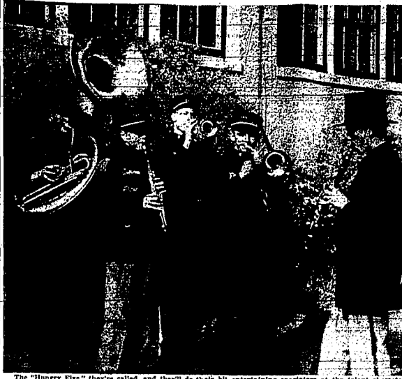
The "Hungry Five," they're called, and they'll do their bit... The talent show to be held in Filner at the high school gymnasium...