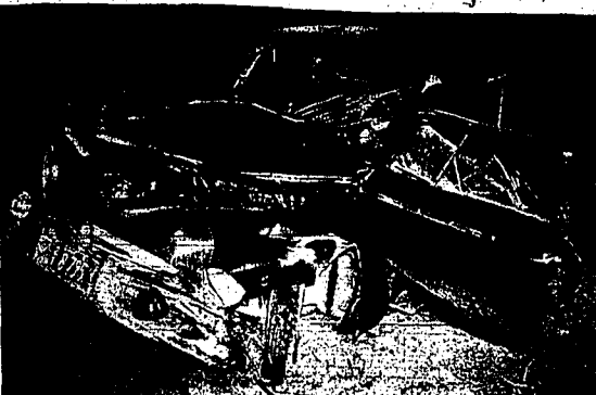
This 1942 Studebaker driven by Robert Hochhalter, 17, Twin Falls, was demolished late Friday when it left a gravel road near Piler and overturned in a plowed field. Young Hochhalter is being treated at Magic Valley Memorial hospital for bruises. The car's axle tipped over 100 feet of fencing.