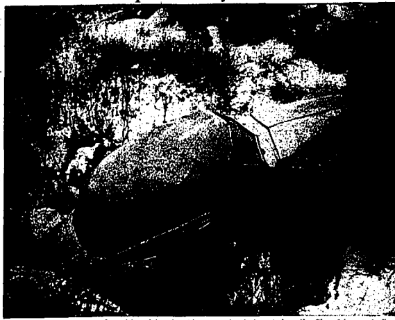
Russell L. Stout, Gooding, leaped to safety when his car went out of control on the Clear lakes grade five miles north of Buhl early Thursday morning. The car plunged down a 100-foot embankment. Stout received a sprained back in the leap from the vehicle. Investigating officials described the car as a "total wreck."