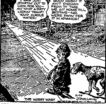
THE WORRY WART By WILLIAMS