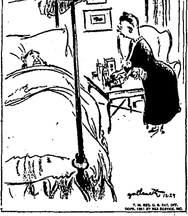
"I told the girl you had a cold—she said it's such a bad day several others had phoned in the same excuse to stay home!"