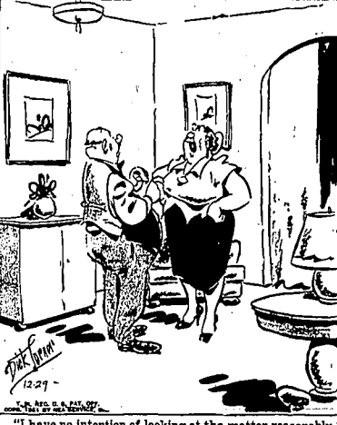
"I have no intention of looking at the matter reasonably, Waldol! After all, why should you win all the arguments?"