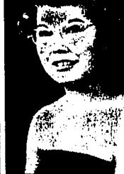
CONNIE PFOST (left engraving)