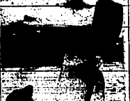
Tony Paolucci, 2 1/2 years old, emulates the nursery rhyme "Rub-a-dub-dub, three men in a tub" as he sails down a North Hollywood, Calif., street during flood waters.

Tony Paolucci, 2 1/2 years old, emulates the nursery rhyme "Rub-a-dub-dub, three men in a tub" as he sails down a North Hollywood, Calif., street during flood waters. The boy was seen on a small boat in the flooded street.