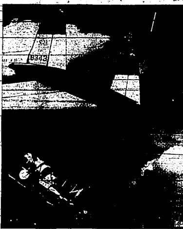
Specialists of the 881st army unit, working with far east air force combat groups, have designed special parachute harness and allied equipment to handle such items as this 105 millimeter howitzer.