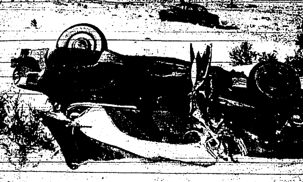
One man was killed and four others injured when this 1951 Chevrolet collided with a train at the Hunt-Eden crossing...