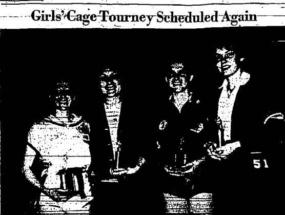
This scene will be repeated again this year in the Richfield girls' basketball tournament for Magic Valley high school teams...