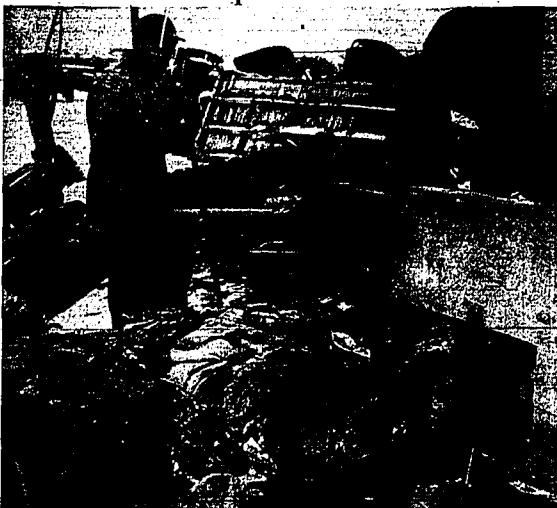
Chister Schmechel and Jack Leisher prepare for another operation of pneumatic, hydraulic baler which bales metal in 300-pound blocks at the Twin Falls Auto Parts, Kimberly road. The charging box is pushing a completed bale toward a truck.