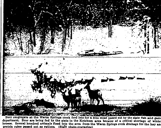
Deer congregated at the Warm Springs creek feed lots for a free meal passed out by the state fish and game department.

Deer congregated at the Warm Springs creek feed lots for a free meal passed out by the state fish and game department. Deer are being fed by the state in the Ketchum area because of a critical shortage of winter browse.