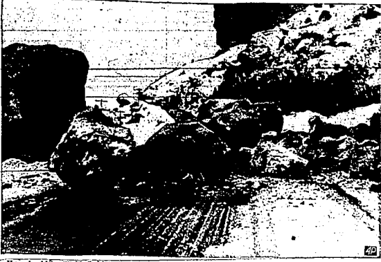
Huge boulders fill U. S. Highway 39 in Echo canyon 30 miles east of Ogden, Utah, completely blocking passage. They fell from level cliffs...