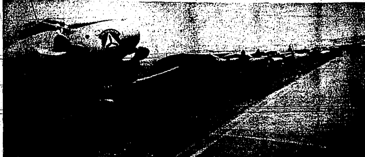
General Twin Falls airplanes are shown in this pre-flight lineup...