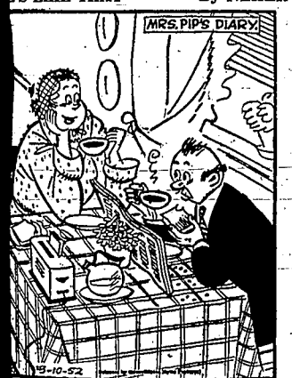
"I'd like to borrow that $20 you've got hidden in that dresser drawer."