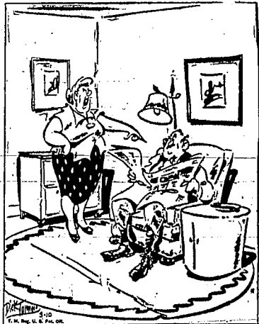
"Another thing, Elmo! Stop trying to change the subject by not answering what I say!"