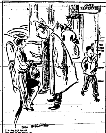
"Maybe I ought to go in alone to price the house—you look like a lot of dough in that new fur coat!"