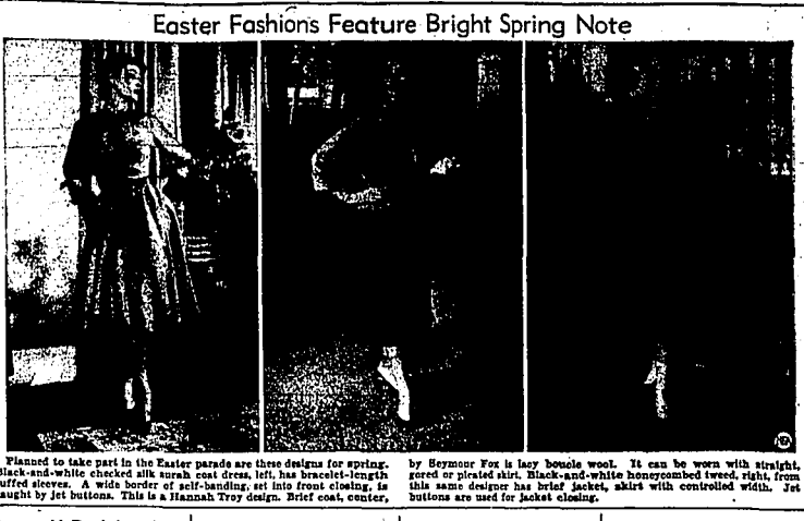
Easter Fashions Feature Bright Spring Note Planned to take part in the Easter parade are these designs for spring...