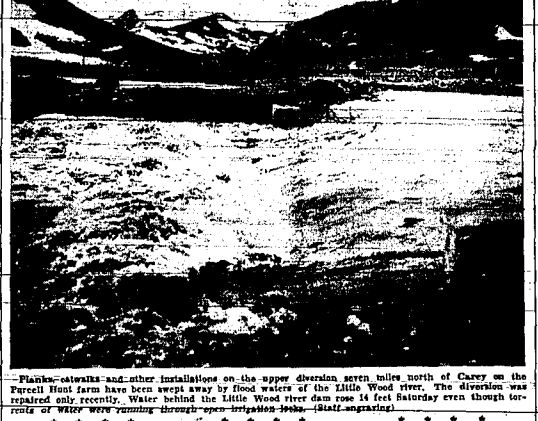
Plankton-catchers and other installations on the upper diversion, seven miles north of Carey on the Little Wood river...