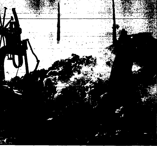
This mass of burned rags, wool and wood in the foreground was on a building at the Western Salvage Co. which contained about $30,000 worth of new machinery and $3,000 of the high structure in the background is a new building which was started last fall and was damaged.