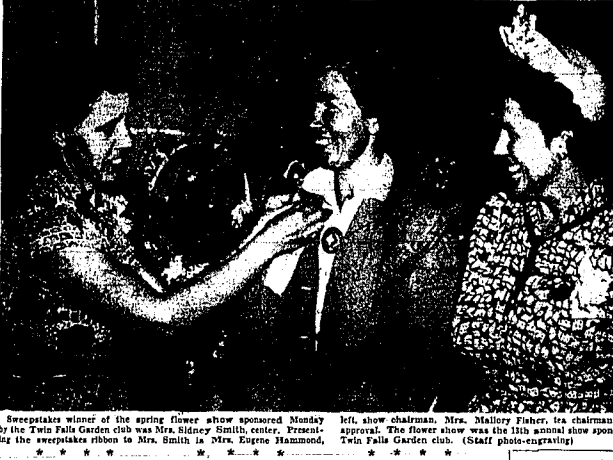
More Than 500 From Eight States See Exhibits at Annual Flower Show Here