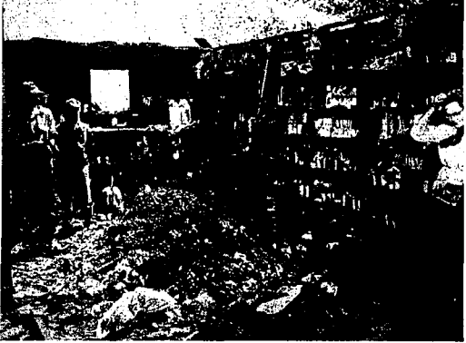
Unidentified Murtaugh youngsters help remove debris from the Goodman store at Murtaugh Saturday after the store and service station were gutted by fire early Saturday. Loss was estimated at about $15,000. Gasoline storage tanks were not ignited. (Staff photo—reprinted)