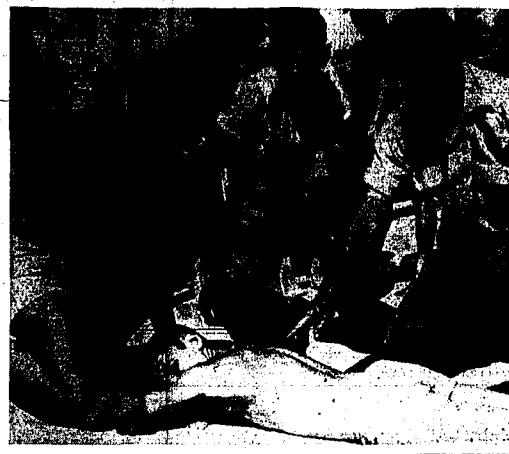
Bill Oates, his guard at municipal swimming pool, demonstrates the pressure-arm lift method of artificial respiration to Bobby Johnson...