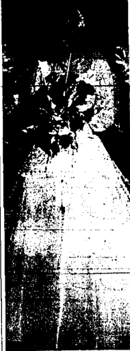
MRS. KENNETH H. NEWMAN

It takes about 1,000 full-sized coconuts to produce 25 gallons of oil. NO. 1 HEADACHE RELIEF with millions who make it their first choice WORD'S LARGEST SUPPLY St. Joseph ASPIRIN AT 104