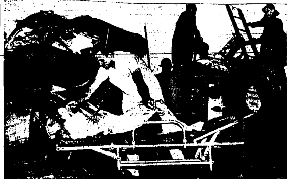
An ambulance attendant covers remains of a victim as firemen (background) continue their search of the burned-out wreckage of the two buses.