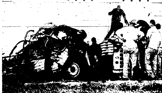
Firemen and rescue workers search the fire-swept wreckage of two Greyhound buses which collided head-on near Waco, Tex. At least 29 persons lost their lives. Authorities are at a loss to explain the accident which occurred on a straight stretch of highway.