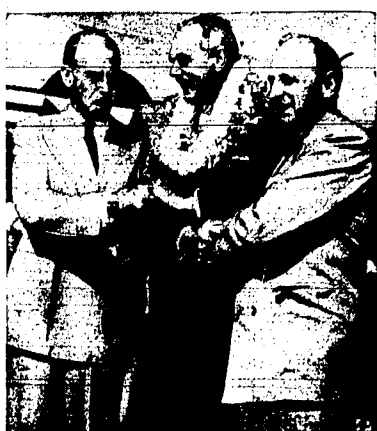
Secretary of State Dean Acheson, after a flight from Washington, D. C., plagued by mechanical difficulties, has a happy smile on his face as he is greeted at Honolulu by Richard (erry) Heffli, Australian minister for external affairs, and Clifton Webb (right), New Zealand foreign minister. Acheson arrived in Honolulu 24 hours late, to attend a Mutual security conference between the U. S., New Zealand and Australia.