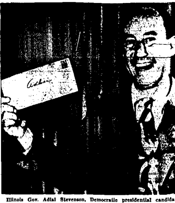
Illinois Gov. Adlai Stevenson, Democratic presidential candidate, laughs over letter addressed only "Adlai" and postmarked San Antonio, Tex., delivered to him in Springfield, Ill. Stevenson told reporters it proves he is well known.