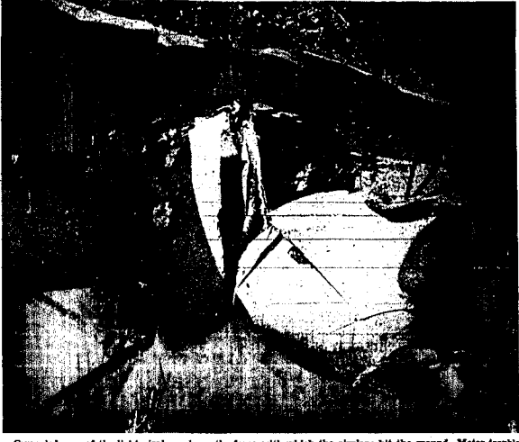
Crumpled nose of the light airplane shows the force with which the airplane hit the ground. Motor trouble caused the plane to lose altitude.

REXDALE, Aug. 11—The Rexdale softball team won the title in the play of the season in defeating the Bull team. The game was played at Rexdale on Aug. 11.