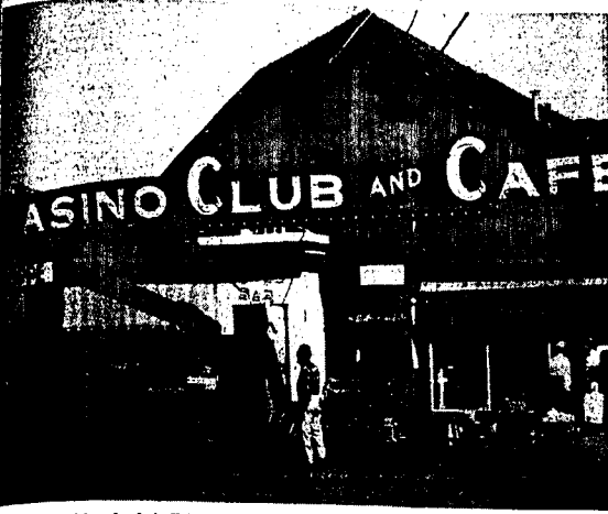
The Casino club and cafe in Ketchum was damaged by a fast fire shortly before noon Wednesday. The fire started in the rear of the building, struck through an upstairs window and all but gutted the upstairs news and apartment. Water did considerable damage to the club and cafe downstairs. While firemen were fighting the fire in the rear and upstairs, equipment was carried from the club and deposited along the street. (Staff photo- engraving)