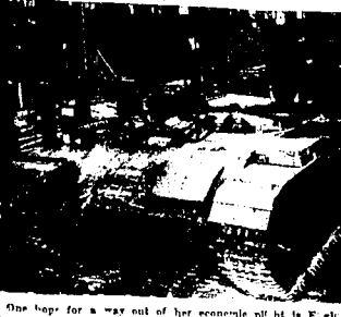
One hope for a way out of her economic pit lies in the E. plan to expand the defense program.