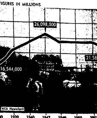
FIGURES IN MILLIONS. The outlook for the nation's milk drinkers is sad if the seven-year downward trend in our dairy population continues...