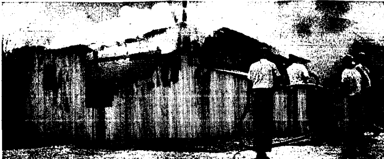
A fire set by a small boy who wanted to see a straw pile burn caused this blaze at A. L. Burgess' farm near Buhl Tuesday. The blaze, fought by fire departments from Buhl, Castletown and Filer, destroyed an 80-foot long barn and nearly 1,600 bales of hay. The straw pile was located at the end of the barn and the wind immediately swept the fire in its side.