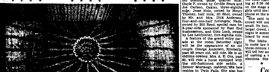
Hollister Grange received first premium for best artistic arrangement for this produce display. Twisted asparagus was used to form the Grange name and the design. (Staff photo-engraving)

Cedar Draw Grange No. 184 received first premium for best quality with this produce display at the Twin Falls county fair. (Staff photo-engraving)