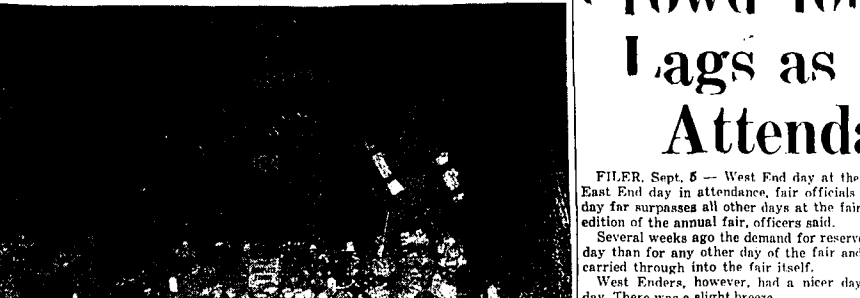
Best Grange Exhibits Selected at Fair

TWIN FALLS, IDAHO, FRIDAY, SEPTEMBER 5, 1953