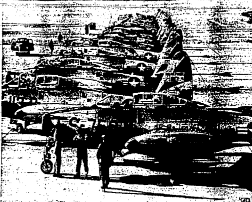
Some of the 21 F-51G Thunderjets of the 27th fighter escort wing en route to join the far east air force are shown lined up at Travis air force base, Calif., for takeoff to Hickam field, Hawaii. In the first group were 14 planes and the remainder followed. The jets are refueled in flight over the Pacific in July.