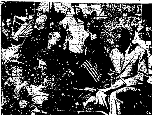
Republican vice presidential candidate Richard Nixon (right) settles down amid a shower of confetti and streamers...