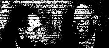
Senate leaders, Democrats Lyndon Johnson (left), Ford, and Republican Robert A. Taft, Ohio, get together after the opening session of the 83rd congress. The session was marked by Taft's tight rein on the proceedings.