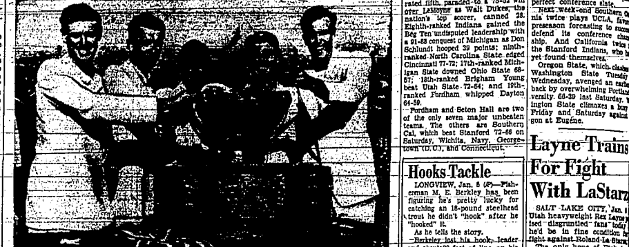
Members of the Australian Davis Cup team shake hands over the trophy after their 4-1 victory over the U. S. team in the challenge round which ended in Adelaide, Australia, Dec. 31. Left to right are Frank Sedgman, Mervyn Rose, Harry Hopman, Lewis Hold and Ken McGregor. Sedgman, the world's No. 1 player, was the captain of the United States and would make his professional debut in Los Angeles.