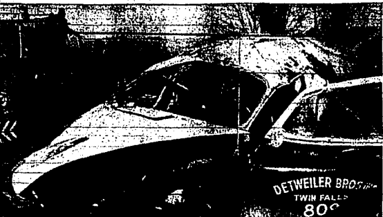
WETWELL BROOKS TWIN FALLS 80° Injured as this 1951 Chevrolet panel truck was demolished Saturday, its occupants, Vern Thomas and Richard Diamond, both Twin Falls, were reported in good condition Monday at Mater Valley Memorial hospital. The truck hurtled 105 feet through the air hitting a sharply elevated railroad crossing at high speed, and rolled to rest 415 feet from the crossing at 18 feet off the road. Thomas received head injuries and Diamond a fractured vertebra.