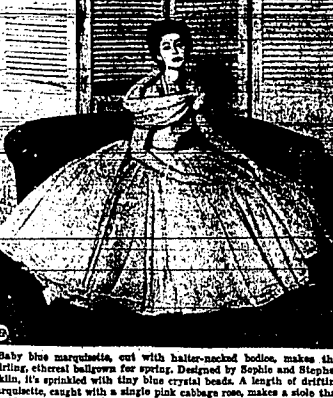
Baby blue marquette, cut with halter-necked bodice, makes this evening dress a masterpiece for spring. Designed by Sophie and Stephen Erkin. It's sparkled with a single blue crystal bead. A length of drifting marquette, caught with a tiny pink cabochon, makes a stole that provides sheer cover-up.