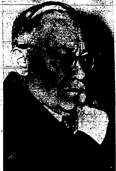
Andrei Y. Vishinsky, sitting home (above) from New York on the Liberite to attend the funeral of former Soviet Premier Joseph Stalin, ponders the news of the resignation of Russia's government. In the shakeup he was demoted from foreign minister to permanent delegate to the United Nations.