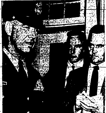
Gen. James A. Van Fleet, retired eighth army commander, brushes aside questions by reporters as he leaves the White House following 70-minute talk with President Eisenhower. The general said he and the President "talked about friendly old times." Newsmen wanted to know if they discussed the ammunition shortage charges that Van Fleet has been making before congressional committees.