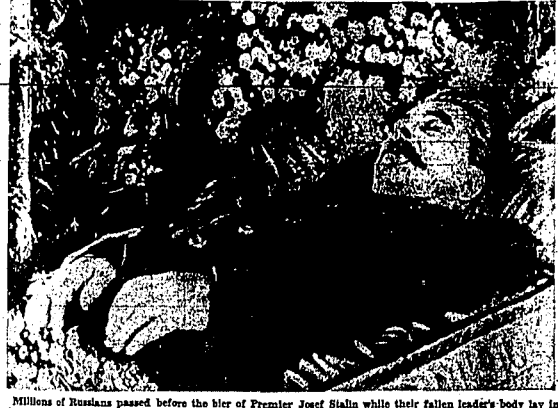
Millions of Russians passed before the body of Premier Josef Stalin while his fallen leader's body lay in state in the hall of columns in the house of unions in Moscow.