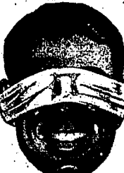
WHO IS THE UNION MOTORS MYSTERY MAN?