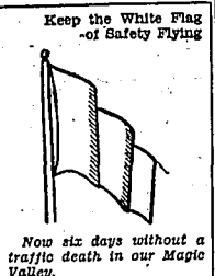
Keep the White Flag of Safety Flying