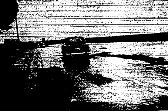
Cars were limited to one-way traffic Saturday evening when a flash flood apparently resulting from a freak hail and rain storm in the east covered the section of highway 21 at Amsterdam. The water also flooded part of the A. E. Kunkel ranch, including a corral across the highway. (Staff photo—engraving)