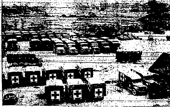
Ambulances and troop carriers begin to stack up at Minnam, Kansas, United Nations base near Panamint, in preparation for upcoming "operation big switch" scheduled to start Wednesday.