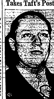
SEN. WILLIAM KNOWLAND

SEATTLE, Wash., Aug. 4 (UP)—President Eisenhower warned today that unless states rights are preserved, "we are not going to have America as we know it." Addressing the annual governors conference here informally, Mr. Eisenhower said he has an "indefatigable conviction" that the traditional authority and responsibilities of state governments must be maintained. He said the federal government should do only those things for the people which the states cannot do themselves. President conceded that it is very difficult to establish a clear dividing line between national and state responsibilities. Combined Efforts He said the important thing was that the federal and state and local government complement each other. Mr. Eisenhower said determining the dividing line between national and state functions was a problem of coordination of more than functions so that each of us does his part. He said the most important thing is to have each state executive to continuously inform his people what he is doing to support responsible programs. Closer to People He said if governments continued to be distant from the people, "then I think we will be heading in the right direction." He said the important thing was that the federal and state and local government complement each other.