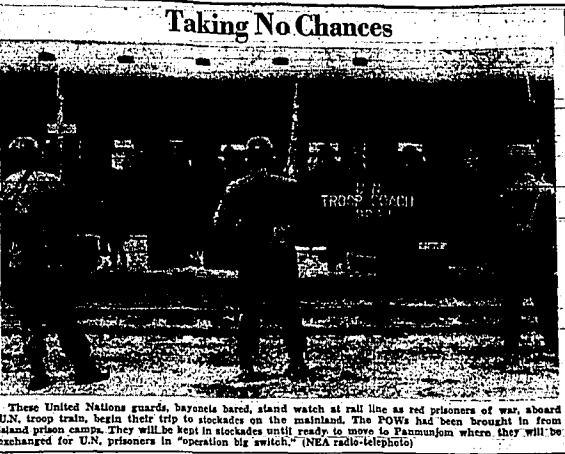
These United Nations guards, bayonet fixed, stand watch at rail line as red prisoners of war, aboard U.N. troop train, begin their trip to stockades on the mainland. The POWs had been brought to island prison camps. They will be kept in stockades until ready to move to Panmunjom where they will be exchanged for U.N. prisoners in "operation big switch."