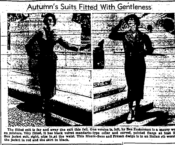
The fitted suit is far and away the suit this fall. One version is, left, by Ben Zuckerman in a mauvy wool-mixture. Very fitted, it has black velvet mandarin-type collar and curved, pointed flange at bust line. Box jacket mid, right, nips in at the waist. This Monte-Sano and Pruzan design is in an Italian rib worsted, the jacket in red and the skirt in black.

Autumn's Suits Fitted With Gentleness ... By KAY SHERWOOD NEA Staff Writer ... New drapery and window fabrics make a strong pitch to contemporary home owners with such decorating problems as too much window glass to curtain and open door plans.