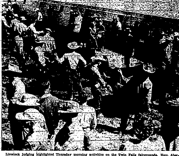
Livestock judging highlighted Thursday morning activities on the Twin Falls fairgrounds. Here, Aberdeen Angus exhibitors line up their entries before judges and a host of spectators. Fair attendance Thursday topped 10,000.