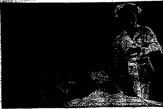
HOSPITAL BOARD AND ROOM