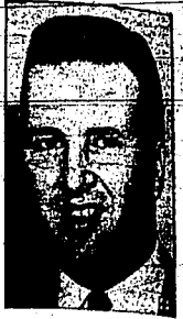
HENRY FORD II "YOU SELL THEM... WE'LL BUILD THEM"

Celebrating our 2nd Anniversary as Buhl's Ford Dealer and the earning of Ford's GOLD-LEAFED AWARD. We're going to sell 15 new Fords and 15 Used Cars in a gigantic 30 IN 3-DAYS Sale.