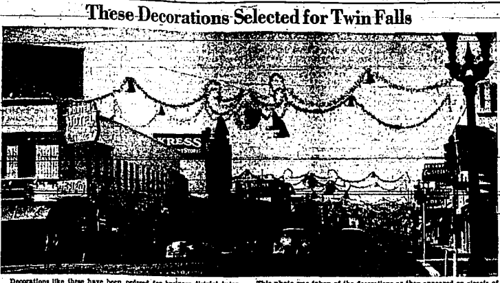
Decorations like these have been ordered for business district intersections in Twin Falls this Christmas season. A drive for better Christmas decorations is being spearheaded by the Chamber of Commerce.

Japan No Threat, Leader Avers Oct. 6—Japan will become a threat to the United States even though it remains a communist-dominated nation, former Premier Hiroshi Ashida said today. "A steadily growing military power in Japan that no longer respects the burdens and responsibilities of a democracy," he said in an address before the National Association of Manufacturers, "is a threat to the maintenance of peace and independence." He said that the only way to meet the challenge of a "military power in Japan, which is a firm believer in any sovereign nation's right to defend itself." "I am sure, realize that the United States today."