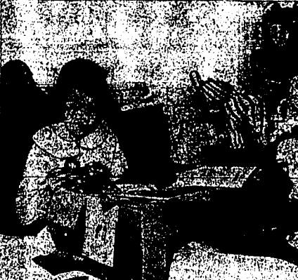
A cardboard carton turned upside down and with space cut out for legs makes an adequate bed table for a convalescing child. Household materials and odds and ends may be assembled to provide time-passing entertainment.