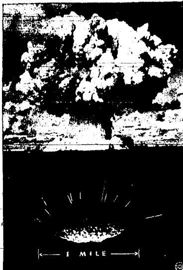
Photo-diagram illustrates terrific force of H-bomb that tore a cavity in the floor of the Pacific a mile wide and 175 feet deep.