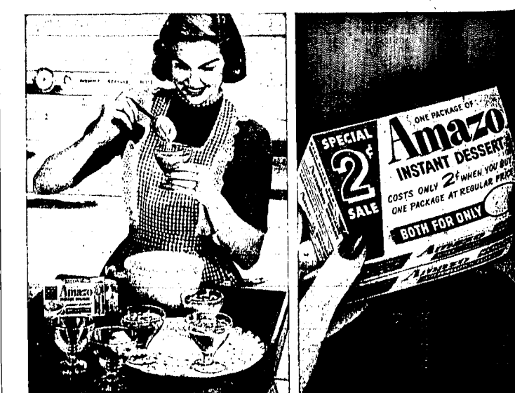
And you have six servings ready to eat! And Amazo is now on special sale. Buy one package at regular price, get another for only 2¢!