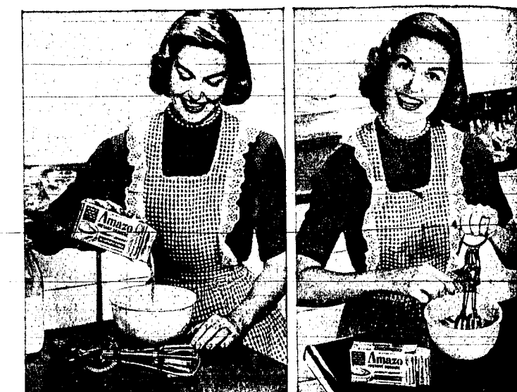
Add Amazo to pint of cold milk... Mix it up for about 30 seconds...