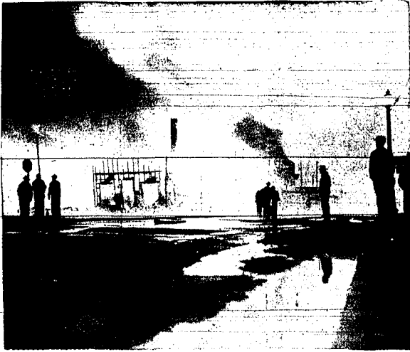
This blaze destroyed the Pocatello Lumber company yard at Pocatello Wednesday. Damage was estimated between $400,000 and $500,000. The flames also damaged a residence and laundry plant.