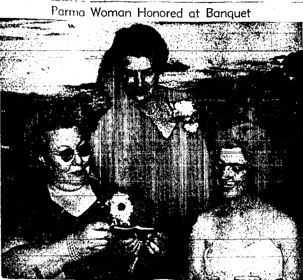
Parma Woman Honored at Banquet