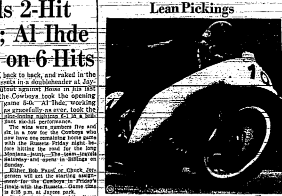
Italian champ Francesco Molinari leans hard as he goes around a curve during 200-kilometer motorcycle race in Italy. He won the race, defeating competitors from four nations.