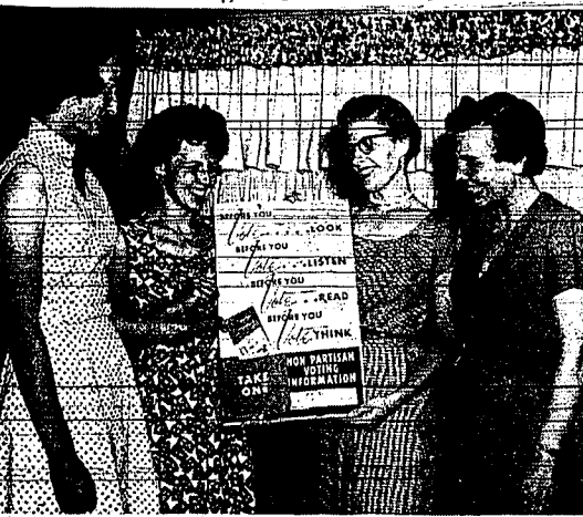
Members of the League of Women Voters display one of their get-out-and-vote posters to be used in an effort to encourage citizens to vote in the election primaries.

INDOCHINA, July 16 (AP)—Returned French prisoners charged today that nearly 500 French Union soldiers died in a "death march" from Dien Bien Phu to the north.