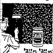
219 Ft. 345 cts.