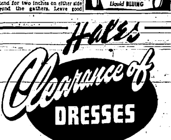
One Rack of 75 Dresses to Go at

Hales The new Hales dresses are now available. They are elegant and stylish and will keep you warm and fashionable. The Hales dresses are a must-have for every woman who loves to stay fashionable in the winter.