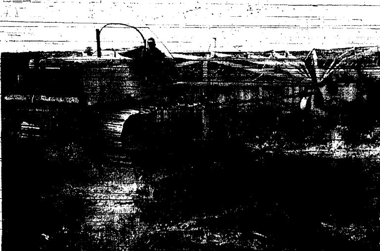
Modern-homesteaders face a somewhat different proposition than was faced by homesteaders 50 years ago. This tractor and excavator grubber is clearing land for new homesteaders on the northside agricultural project. Fifty years ago most of the sagebrush was cleared by hand.