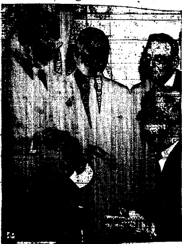
President Eisenhower hands Sen. Walter F. George, D., Ga., one of the pens he used Saturday in signing the resolution for defense of Formosa in a White House ceremony...