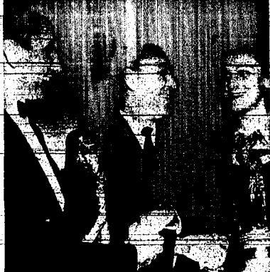
Ben Hogan, center, congratulates two winners of the Ben Hogan trophy as he presents them with the awards in New York. U. S. Open champion Ed Furgo, left, is the 1954 winner and Babe Didrikson Zaharias, right, was 1953 winner. Trophy is given annually to the golfer who has overcome physical handicaps. Furgo's left arm was shattered in a playground accident when he was a youth. It is 10 inches shorter than his right arm and is permanently crooked at the elbow. Mrs. Zaharias was stricken with cancer.